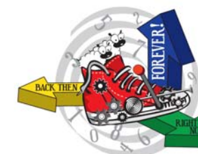
A Time Travel Quest Thru Hebrews 13:8

This month we once again have VBS happening at our church with a theme that so excitingly invites us (yes "us," not just the kids!) to stand in awe before a Jesus who is the same, yesterday, today and forever (Hebrews 13:8).